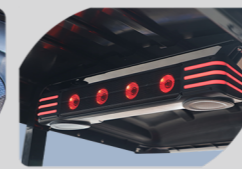
Cuboid Evolution Sound Bar