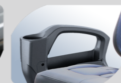
Rear Armrest With Built-in Storage Compartment