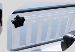
Slideable Air Vents