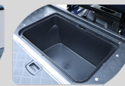
Rear Storage Compartment