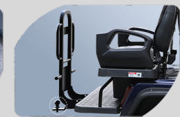
Rear Handrail with Optional Towing Hitch Receiver